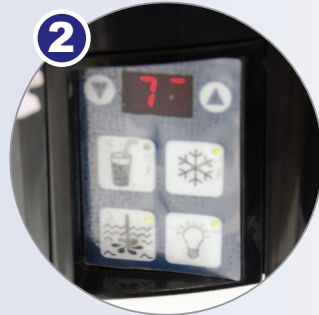
Adjustable Slush Mode