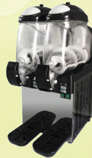
39678 (2 Bowls)