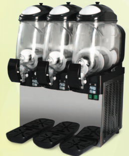
39679 (3 Bowls)